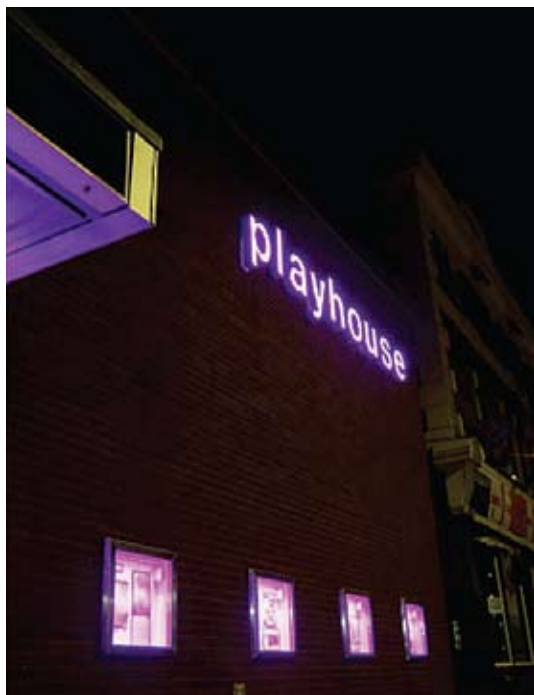
Erith Playhouse.