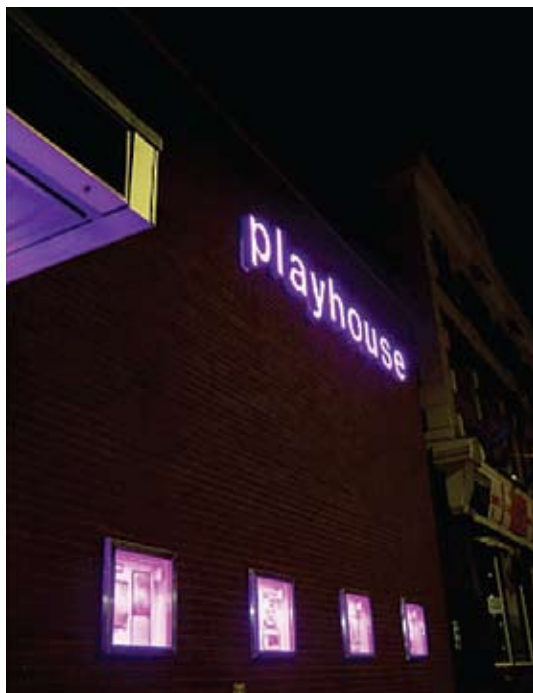
Erith Playhouse.